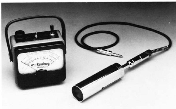
FIG. 1 Analog Paint Application Test Assembly