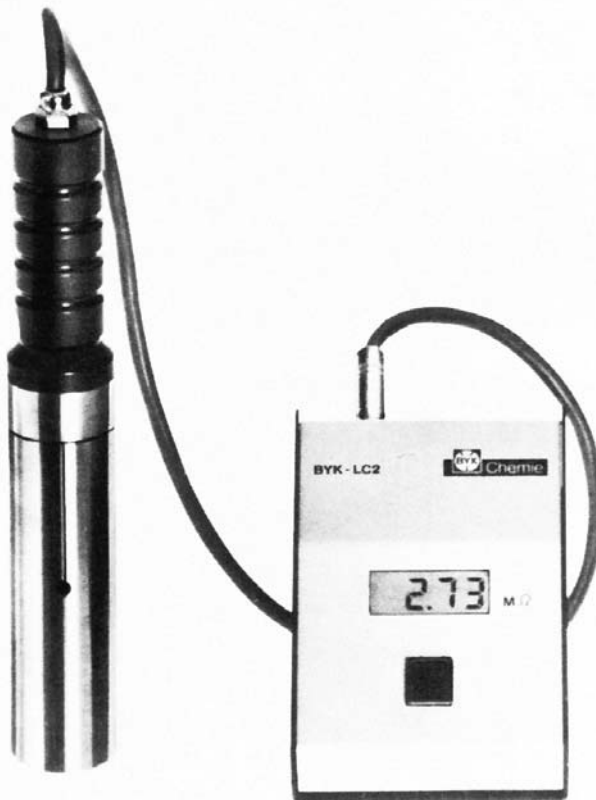
FIG. 3 Conductivity Meter

for all electrostatic applications. To provide greater accuracy in measuring low resistance paints, the meter is equipped with dual range selection. Range “A” is .005 to 1 \text{M}\Omega , Range “B” is .05 to 20 \text{M}\Omega . The original version of this device was an analog instrument with a pointer and scale as shown in Fig. 1 and many such instruments are in use. It has been replaced by a digital version, a diagram of which is in Fig. 2.